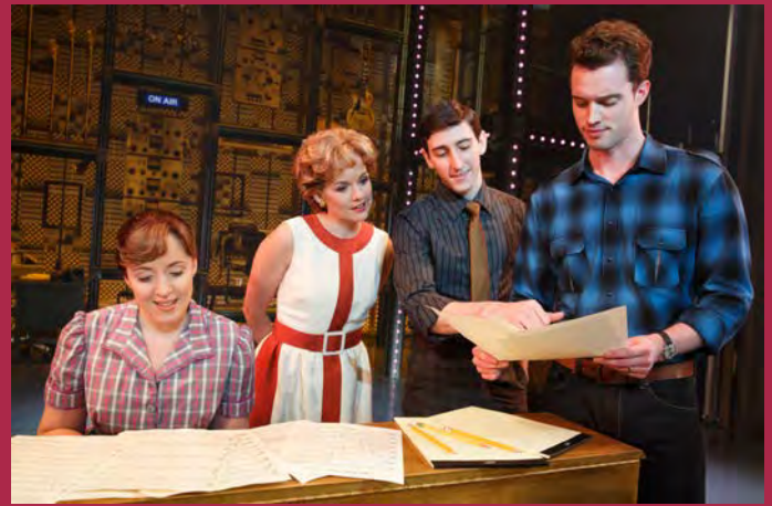
Original Broadway Cast in BEAUTIFUL - The Carole King Musical.