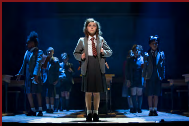
Matilda The Musical Original Broadway Cast.