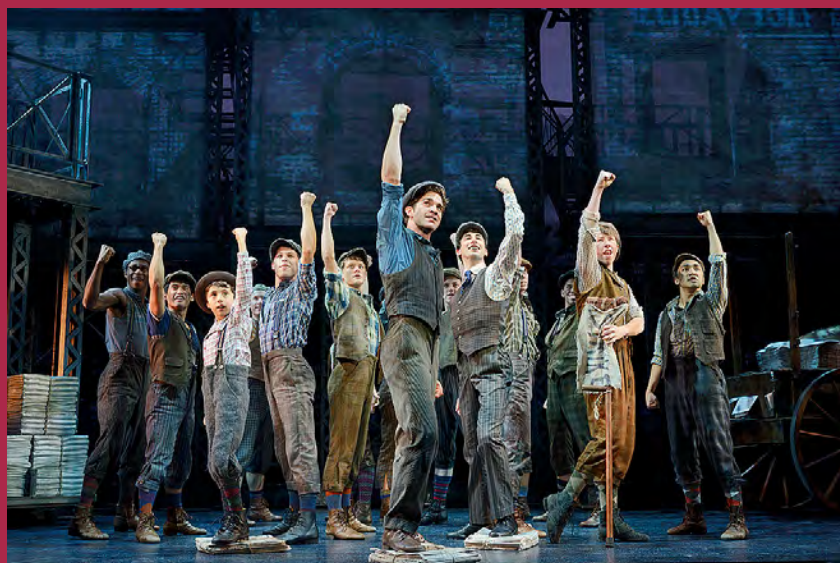
Original company, North American Tour of NEWSIES.